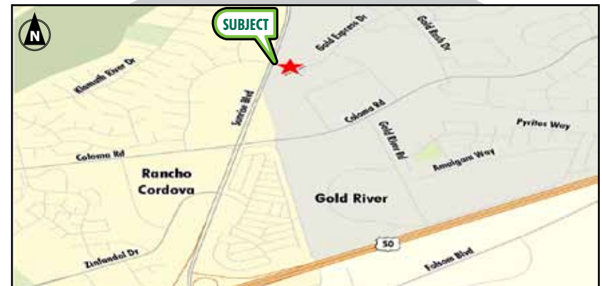
MAPS ARE NOT TO SCALE